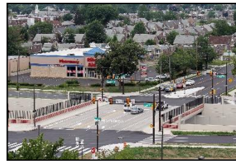
Short Span Category Holme Avenue over Roosevelt Boulevard- HNTB Corp.