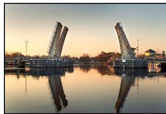
Medium Span Category Elizabeth City Bascule Bridge- Modjeski and Masters, Inc.