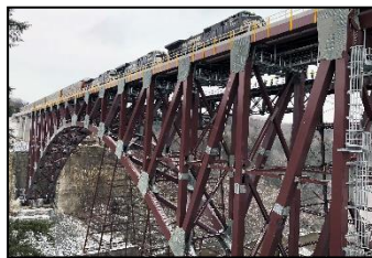
Long Span Category Portageville Railroad Bridge- Modjeski and Masters, Inc.