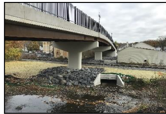
Short Span Category Messinger Street over Martins Creek and Norfolk Southern Railway Co.- AECOM