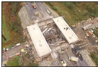
Medium Span Category Bridge NB-355 over Crackersport Road, PA Turnpike MP A 57.66- Larson Design Group